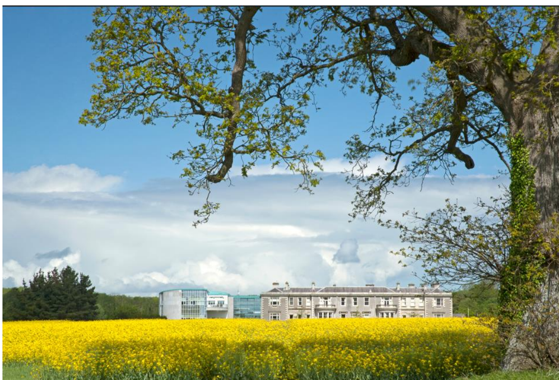
Teagasc Head Office, Oak Park, Carlow, R93 XE12